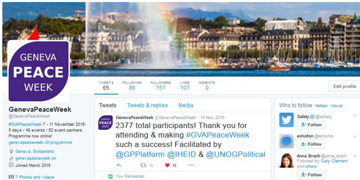
Geneva Peace Week Twitter page