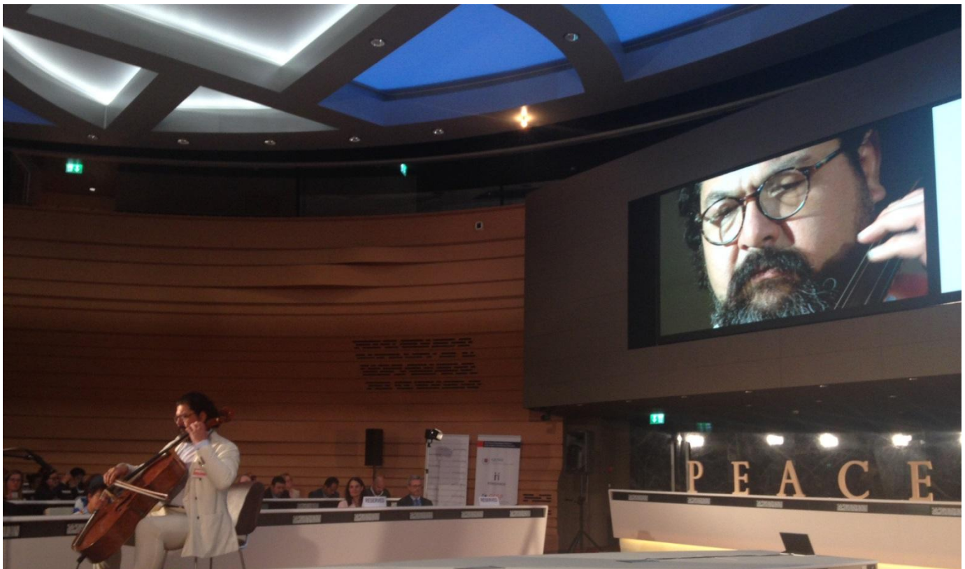
Karim Wasfi performing at the Geneva Peace Talks 2016