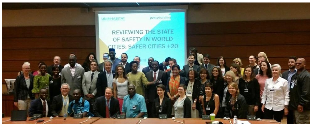
'Safer Cities +20' Conference Geneva, 6-8 July 2016