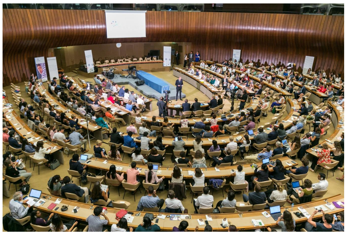
The Geneva Peace Talks 2018 at the Palais des Nations – Tardy for Interpeace

A particular note of gratitude goes to all 120 event organizers of Geneva Peace Week 2018 for their continued engagement in this collective initiative. Geneva's peacebuilding landscape is diverse and decentralized and only by combining forces can the true breadth of peace-related work that takes place in Geneva be fully appreciated.