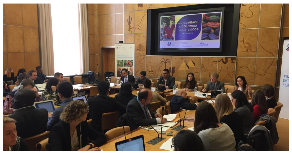
Event by the International Trade Centre on 'Building Peace in Colombia through Cocoa Experts' during Geneva Peace Week 2018.

The overall objective of the scoping study was to inform the decision-making about the development of Geneva Peace Week, to provide recommendations about practical options to advance such an initiative, and to support the implementation of these options. The report highlights the "interest from stakeholders and participating organizations in GPW becoming more curated. The question is how (how far, and in what manner)? The report sets out three broad options for Geneva Peace Week to develop its curation: 1) strengthen the session selection process; 2) develop GPW-directed programming and 3) develop work stream processes which would feed into Geneva Peace Week-directed programming." The report also underlines that "stakeholders must consider what should be Geneva Peace Week's future thought leadership role, and whether to embed the Week in a collective impact process". Based on the scoping study, the Platform will convene various stakeholder consultations.