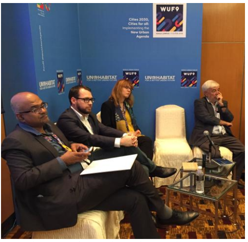
Speakers of the Platform discussion during the World Urban Forum, 12 February 2018