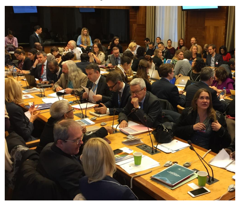
Event participants at the Palais des Nations during Geneva Peace Week